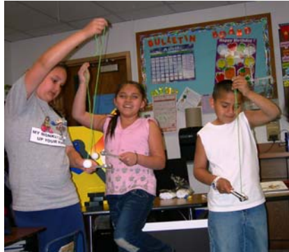
Figure 1: Students learning how sound requires vibration to exist and that it can have power to permanently damage the ear