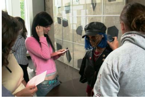
Figure 3: Student using “Jolene” to measure the sound level output of a personal stereo system