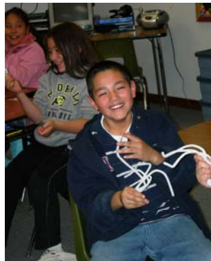
Figure 2: Students finding out how loud sound can damage hair bundles on hair cells causing permanent hearing loss and possibly tinnitus